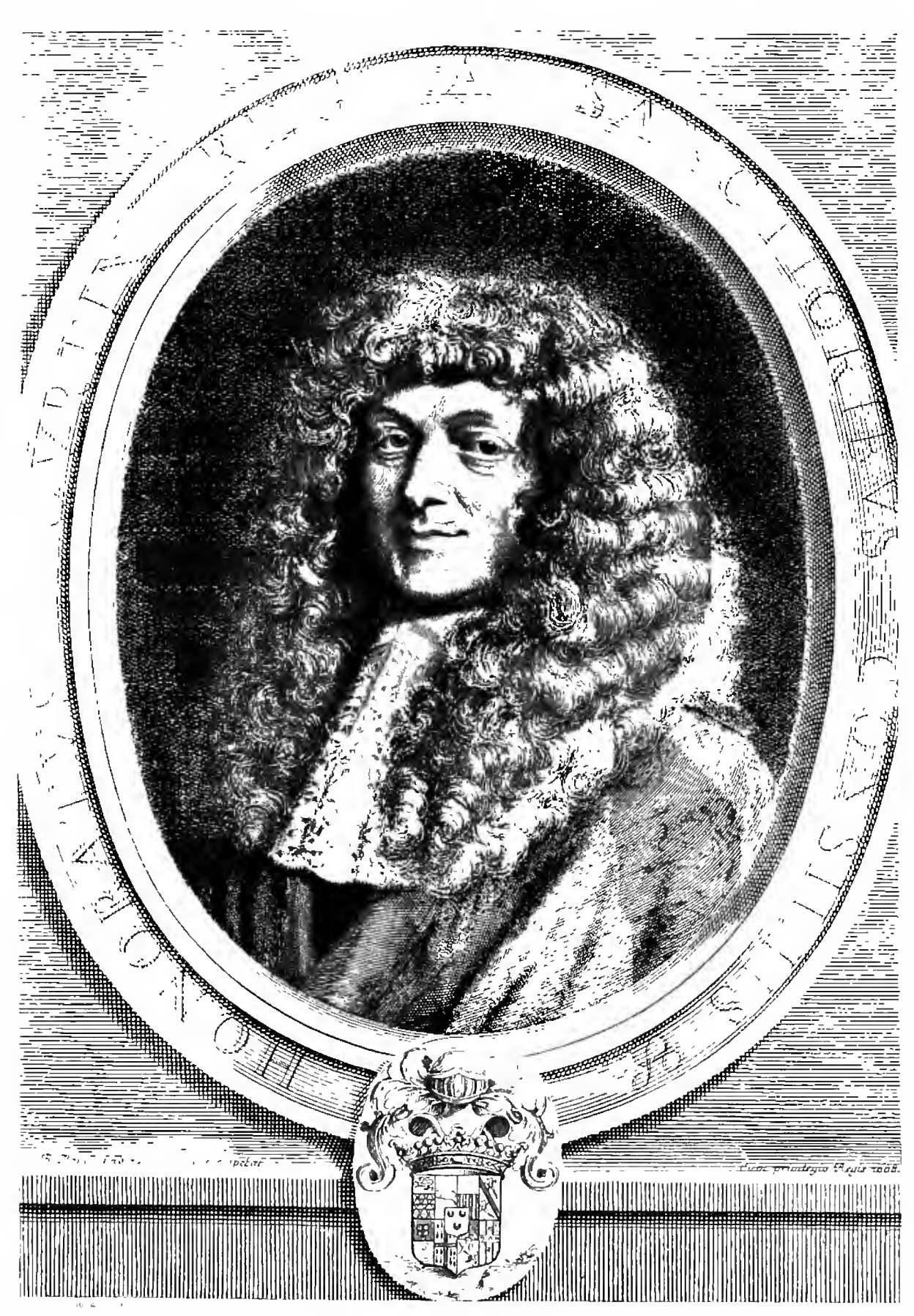
Ronore Courlin Newborsover to England 1663 Vantend